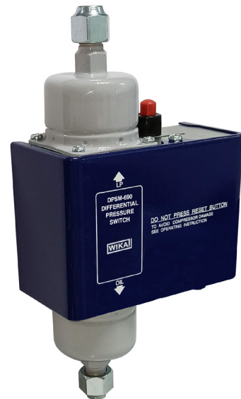
Differential pressure switch, model DPSM-690